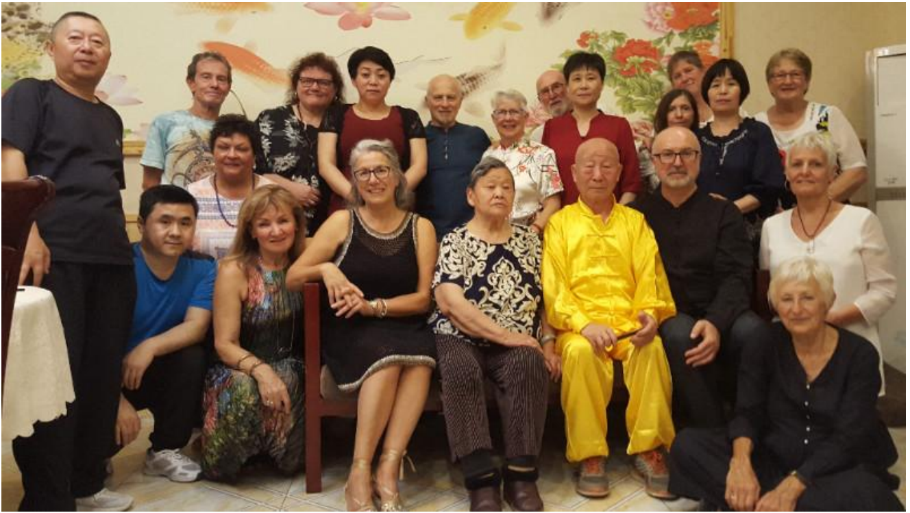
Da Yan Wild Goose Qigong under the guidance of the 28th lineage holder Grand Master Chen Chuan Gang from 2007 to present. Australia now has the most number of lineage students and certified teachers outside of China. The 2018 group