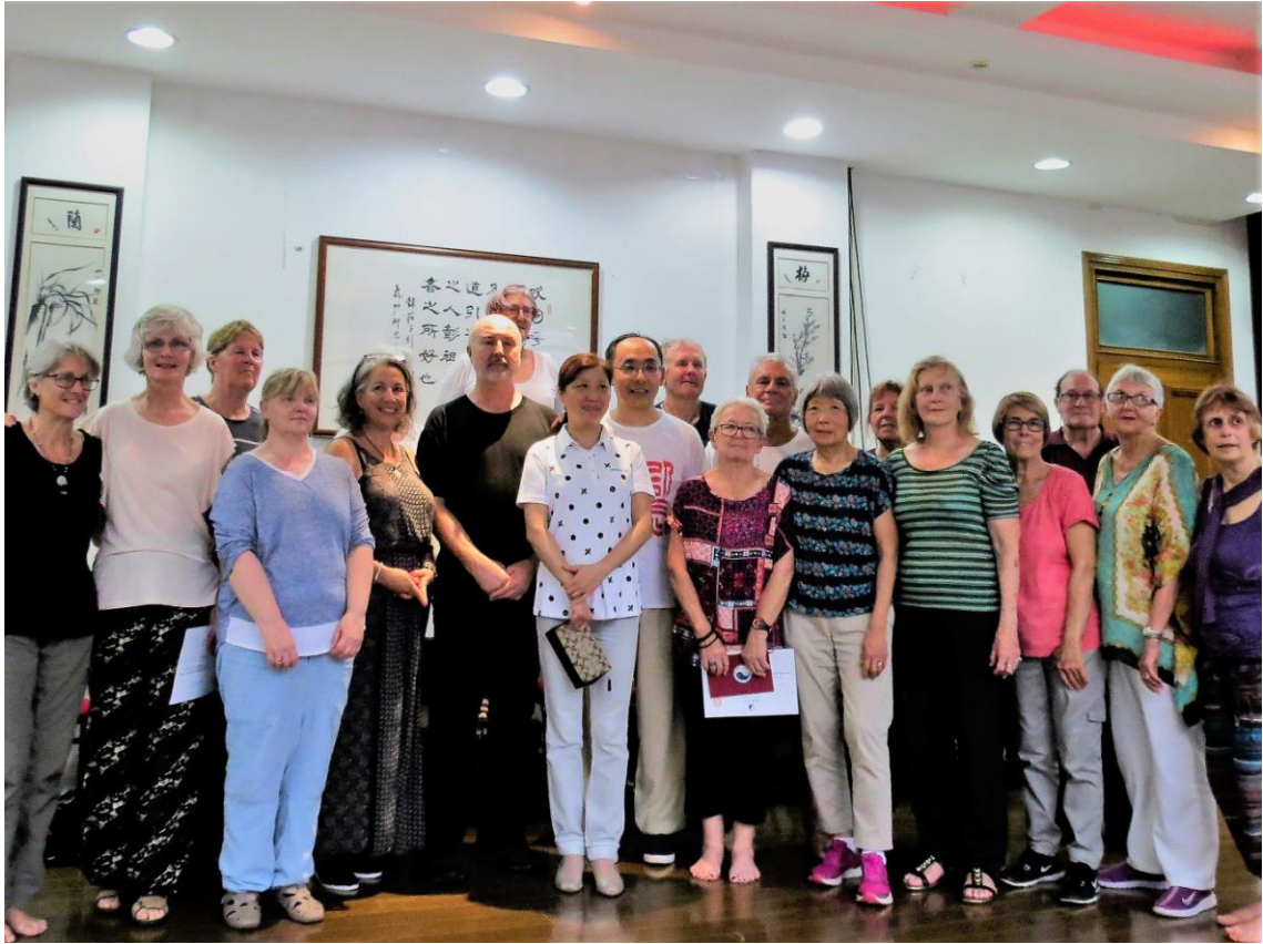
The Shanghai Qigong Research Institute from 2000 to the present. The 2017 group