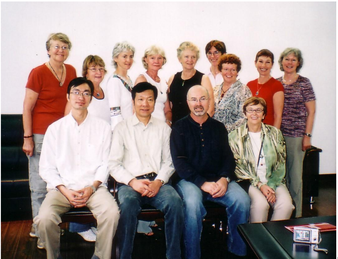
The Shanghai Qigong Research Institute the 2006 group