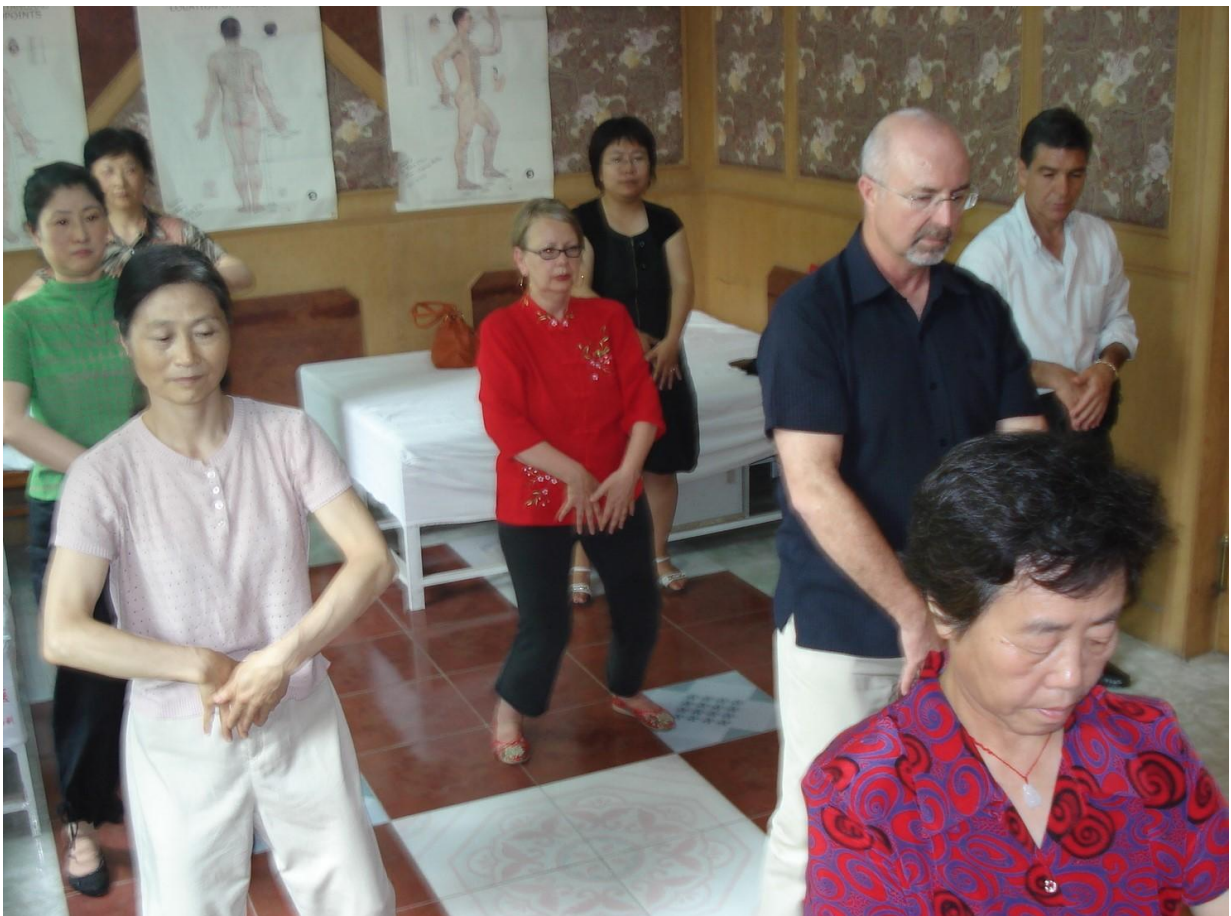
Xiyuan Hospital Beijing 2010